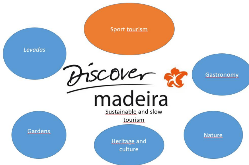
Figure 3. Sport tourism attribute incorporated to the Madeira brand

The brand image of Madeira would increase its value if this input relative to sports tourism is added